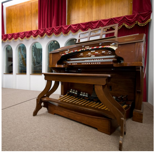
Doors open at 6 p.m. for sleepover guests, 6:30 for concert goers.

Sleepover. For $50 you can enjoy the concert and stay all night! We will treat you to a behind-the-scenes tour of our historic building and let you sleep in exhibit spaces around the museum. Games, Makerspace activities and breakfast are all in the plan!